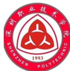
Shenzhen Polytechnic, China